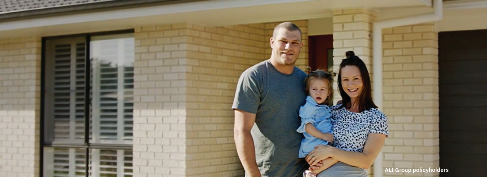
ALI Group policyholders